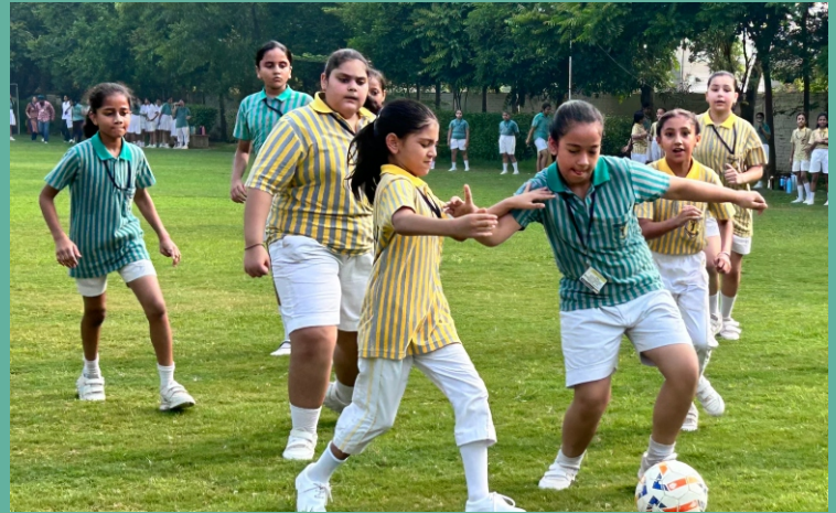
Inter-House Football Matches (Classes IV and V)