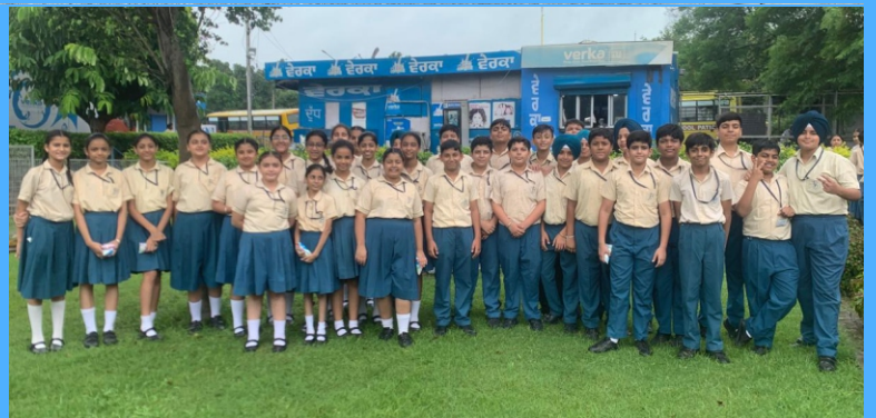
Moo-ving into the world of dairy !