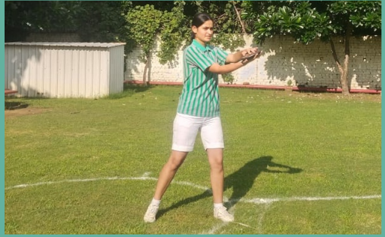
Inter-House Discus Throw Event