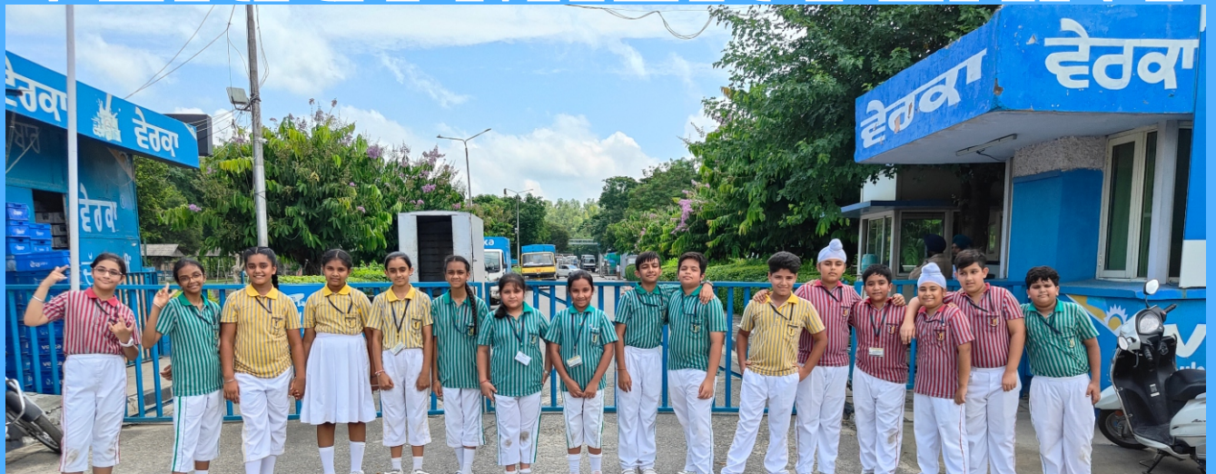
From farm to fridge—discovering the journey of milk!