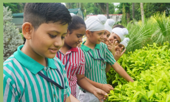
Finding my inner gardener among all these greens !