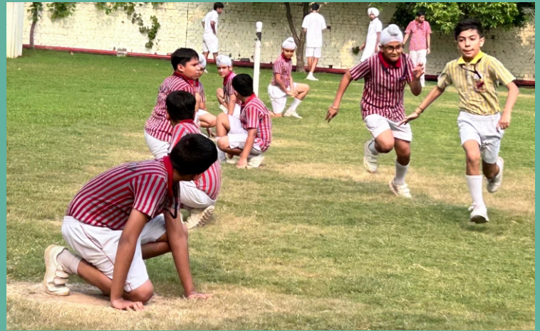
Inter-House Kho-Kho Matches (Classes IV and V)