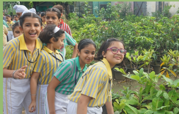
Channeling my inner botanist today !