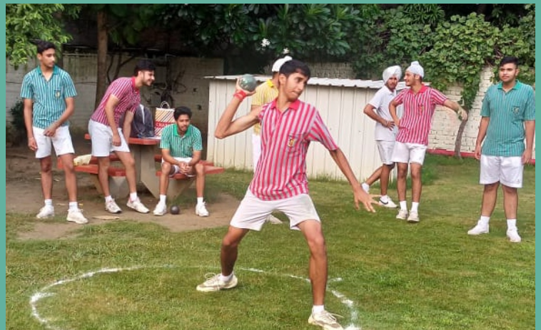
Inter-House Shot-Put Event